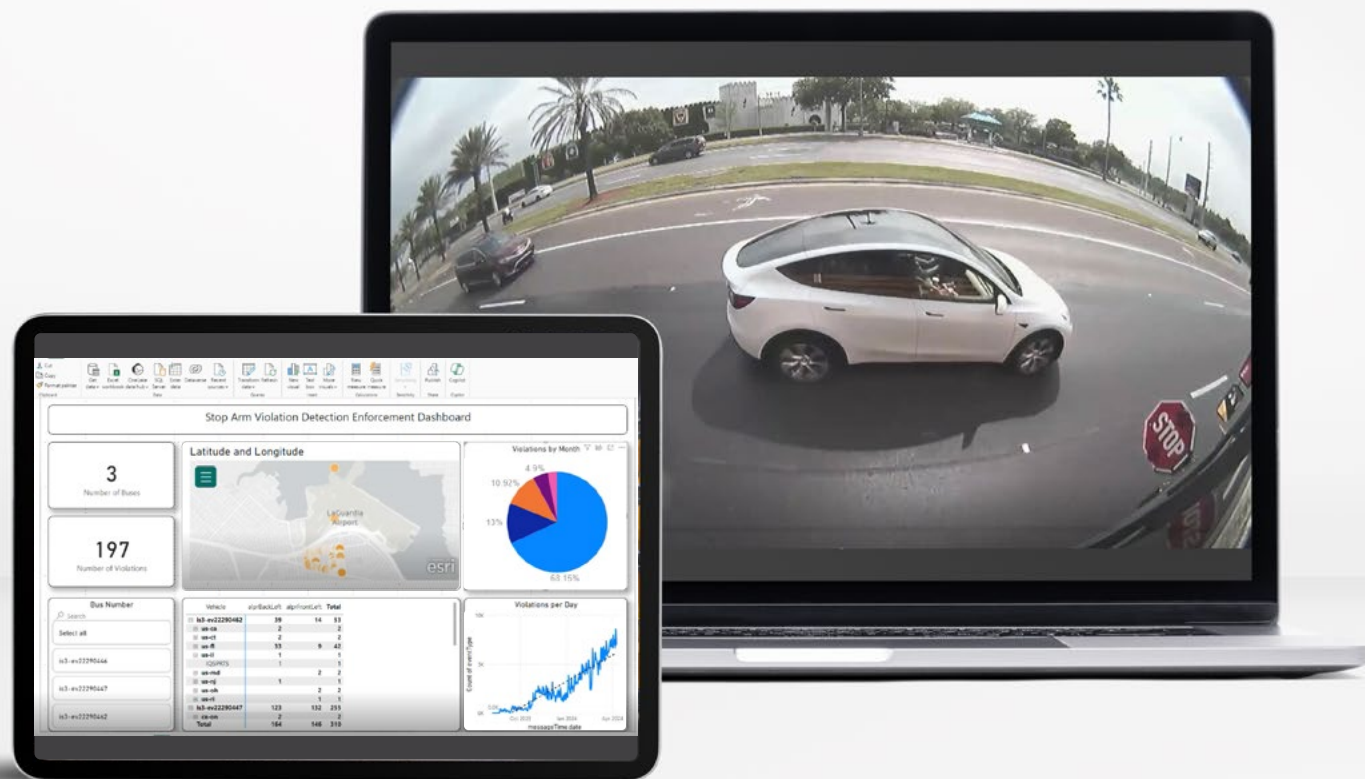
Actual Stop Arm Violation Captured by SAVES

Reduce stop arm violations in your community and improve student safety in the Danger Zone.